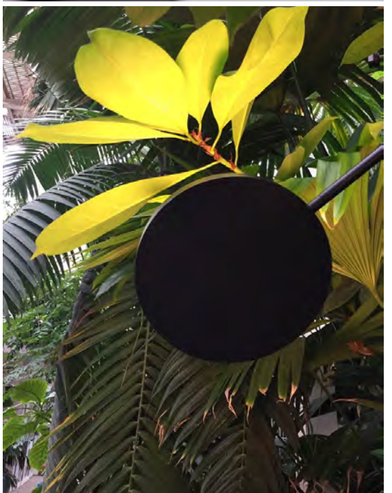
Z Each "mobi" arm has 2 circular LED sources that are connected with a thin tube and O balanced by 2 cables. Every LED cylinder is rotatable and makes it easy to control and in direct the light wherever necessary. At the basis of the design of mobi are highly functional, dim to warm LED modules and optimal light diffusion through precisely calculated optical diffusors. Mobi can be used as a single or double installation to create a graphic and minimalistic character, but combined together they will transform into an O eye-catching chandelier. Its simple and timeless shapes make mobi adaptable for all spaces.